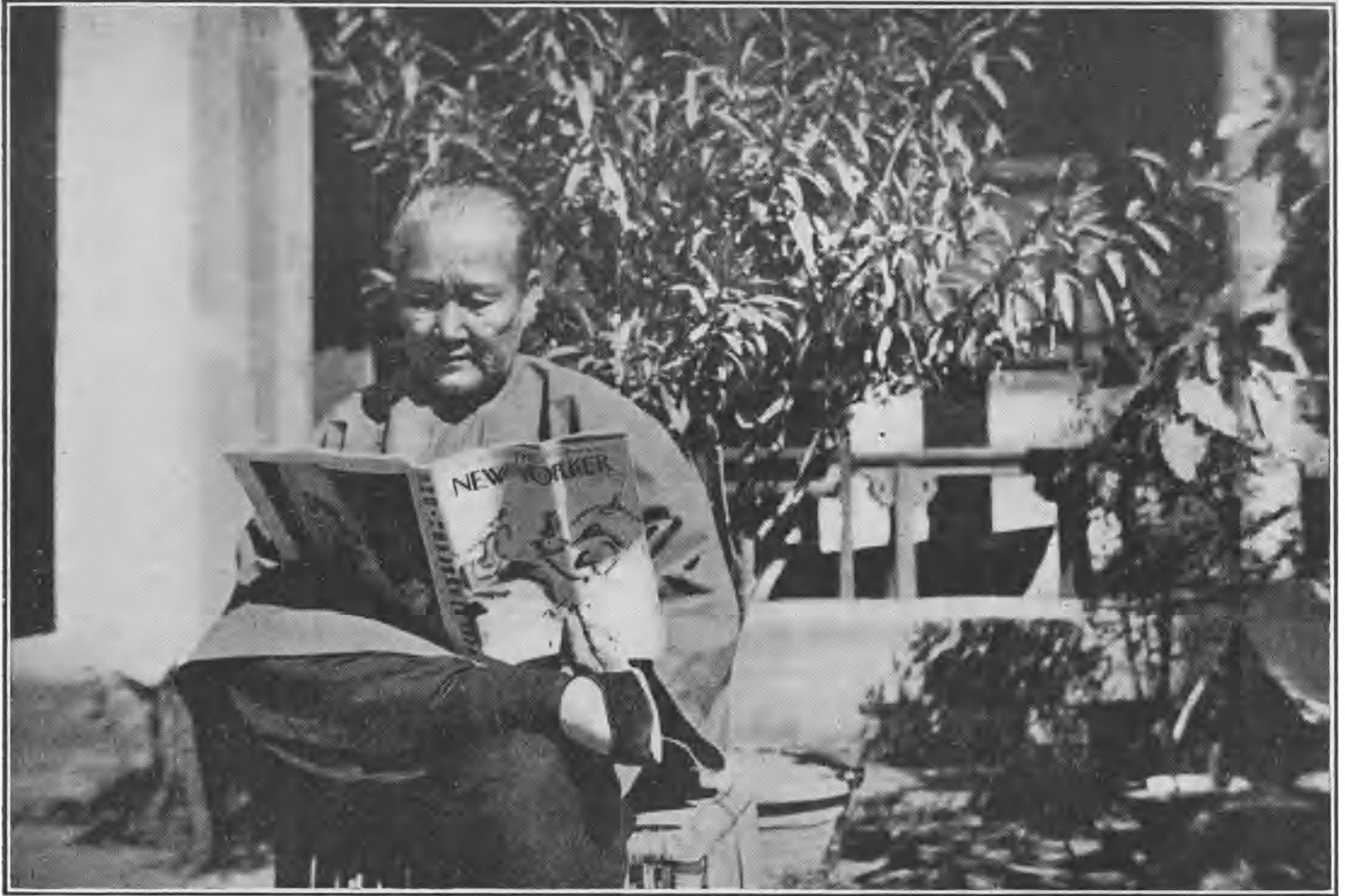
LAO T'AI T'AI LEARNS SOMETHING ABOUT AMERICA